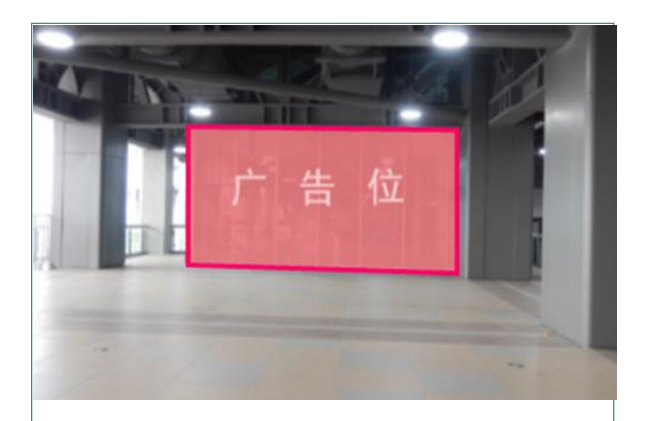
B41 Glass wall advertisement – West registration hall (mezzanine floor)

Specification: 3mH x 8mW Price: USD 3,550