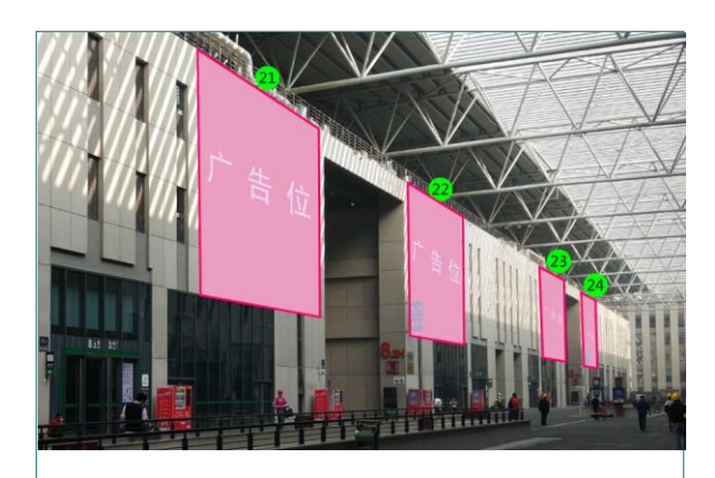
B50 Wall advertisement - Hall external (2nd floor)

Specification: 10.8mH x 14mW Price: USD 22,000