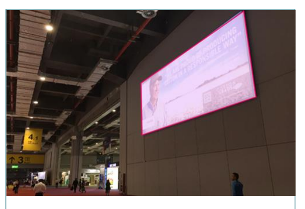
B25 Lightbox - Hall partition (1st floor)

Specification: 10.8mH x 14mW Price: USD 22,000