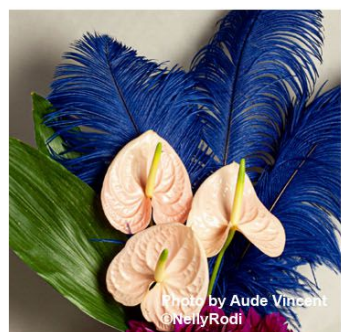
酷炫冲击 BOLD CLASH