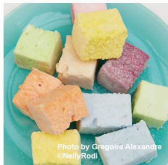
暖自心生 COZY WARMTH

In a world marked by the proliferation of extremists and polarizations, and where opinions are increasingly radical and irreconcilable; in a context of uncertainty and isolation produced by environmental, economic, societal and identity mutations, we must recreate connections.