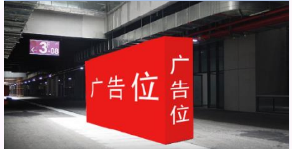
C08 Advertisement panel along drive way on 1st floor (4-side) (new)

Specification: 2.2m (H) x 4m (W) Price: USD 1,200 / RMB 8,400