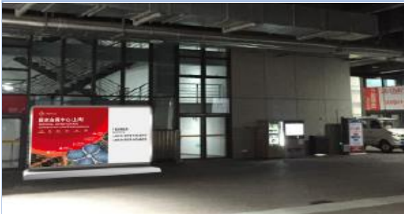
C07 Lightbox along drive way against wall on 1st floor (new)

Specification: 2.2m (H) x 4m (W) Price: USD 1,200 / RMB 8,400