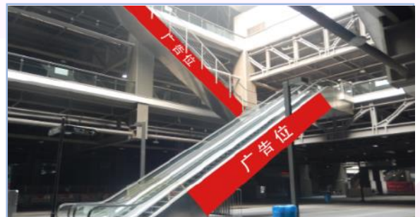
C04 Escalator advertisement - West Skylight

Specification: 3m (H) x 2m (W) Price: USD 1,000 / RMB 7,000