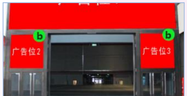
C06 Glass wall advertisement - Main entrances on 1st floor (new)

Specification: 3m (H) x 12m (W) / side Price: USD 4,600 / RMB 32,200