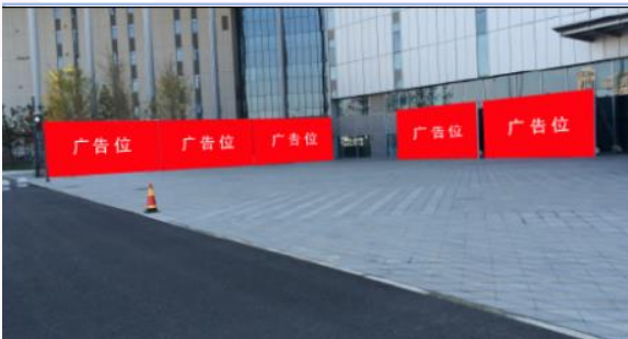
C09 Billboard - North Square (new)

Specification: Front, back - 4m (H) x 8m (W) Lateral side - 4m (H) x 2m (W) Price: USD 12,000 / RMB 84,000