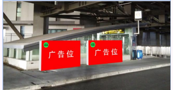
C02 Billboard - Metro station exit no. 4 / 5

Specification: (a) 3m (H) x 8m (W) (b) 3m (H) x 5m (W) Price: (a) USD 4,000 / RMB 28,000 (b) USD 2,200 / RMB 15,000