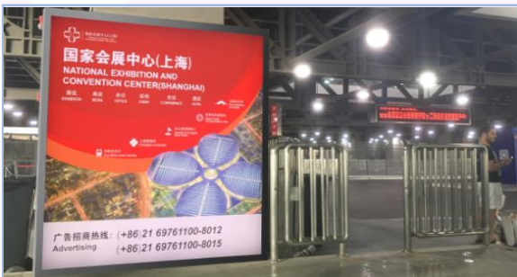
C03 Billboard - Outside metro station exit 5 (near West hall)

Specification: 3m (H) x 6m (W) Price: USD 2,900 / RMB 20,000