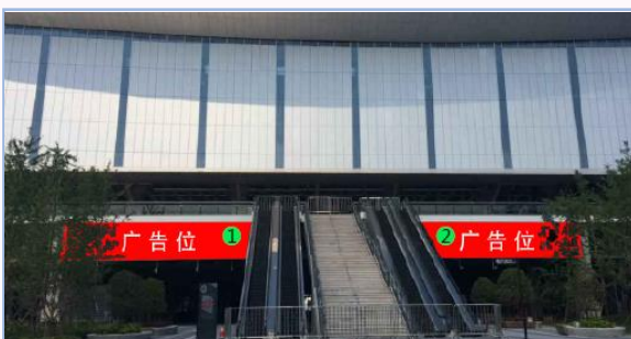
C05 Canvas advertisement - West terrace

Specification: 1.5m (H) x 15m (W) Price: USD 3,000 / RMB 21,000